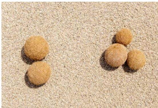
Posidonia egagropili on a Spanish beach

In autumn, just like terrestrial deciduous plants, Posidonia sheds its leaves. This is when seashores become covered in rotting Posidonia leaves, rhizomes and 'egagropili', balls made of fibres from the Posidonia leaves knotted together by the rolling of the waves.