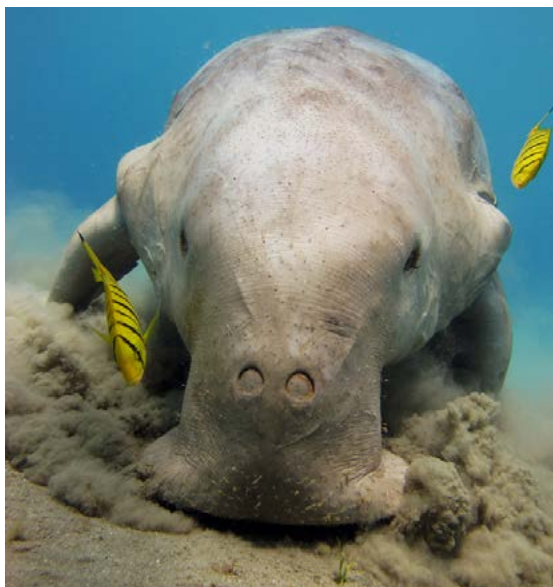
A dugong feeds among seagrass rhizomes, accompanied by pilot jack fish.

From an engineering point of view, seagrass meadows protect coastlines by taking the brunt of currents and waves. In tropical areas, the meadows are often associated with coral reefs. By slowing down the water currents, the meadow causes an increased rate of sedimentation, thus improving the transparency of the water to the greater benefit of the adjacent corals. Seagrass meadows are very diverse ecosystems, offering shelter and food to many species, and acting as fish nurseries for commercially valuable prawn and fish species.