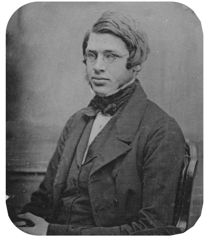
Earliest known photograph of Wallace aged 24

In 1848, the 25 year old Wallace persuaded his friend Henry Walter Bates to accompany him on an expedition to the Amazonian rainforests. They were to study the plants and animals there, collecting specimens to sell along the way. Wallace spent 4 years in the Amazon before sailing back to London aboard the Helen . After just 26 days at sea, the Helen caught fire and sank. All of Wallace's specimens from the final year of his trip were lost in the shipwreck.