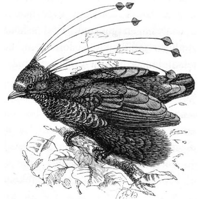
A six shafted bird of paradise from 'The Malay Archipelago'

In 1854 Wallace set off for the Malay Archipelago. He spent 8 years exploring all of the major islands, studying the plants and animals and collecting specimens. It was here that Wallace developed his theory of evolution by natural selection, and theorised about the geographical distribution of animals. During his time in the Malay Archipelago, Wallace collected over 126,000 specimens, including over 80,000 beetles! He later wrote a book about his travels.