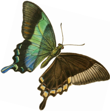
An illustration from Wallace's paper on the Papilionidae butterflies of the Malay