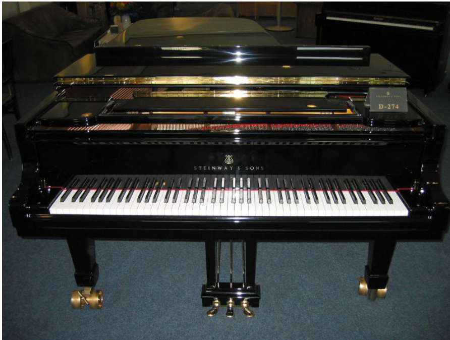
Figure 3: The keyboard of a grand piano.

At the right-hand end of the keyboard, the notes are high-pitched and at the left-hand end the notes are low-pitched .