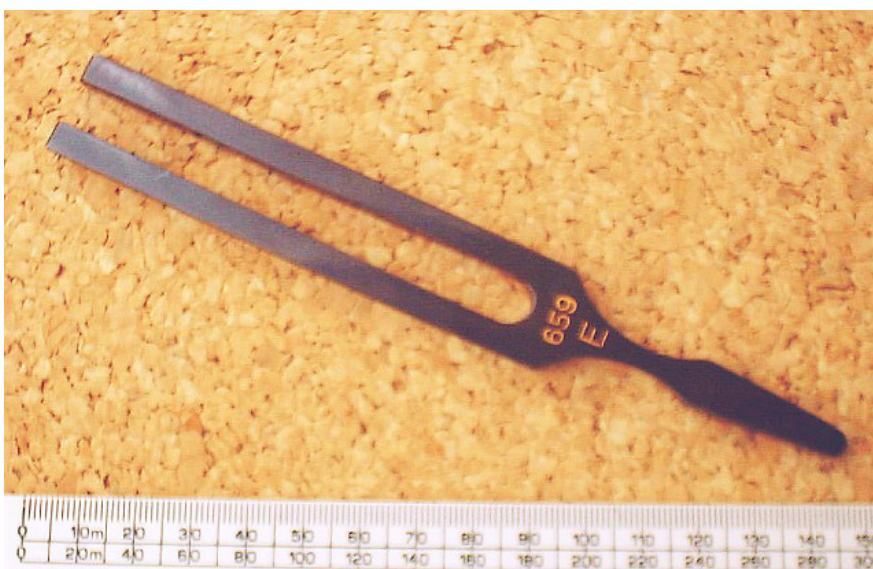
Figure 4: A tuning fork for the musical note E.

Each tuning fork makes a sound with a specific pitch, so you listen to the fork and a note from the piano and then adjust the piano until they sound the same pitch.