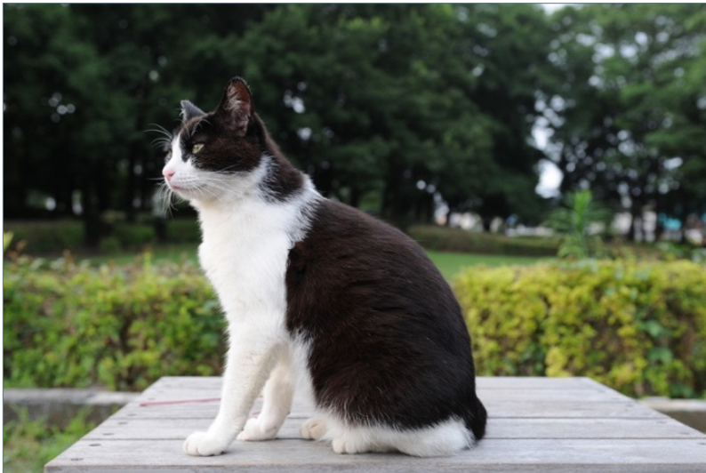
Figure 1: A black and white cat.

Figure 1 shows a black and white cat sitting on a table. We can see the cat and the table on which it is sitting because they reflect light . To appreciate what colours are, we need to understand the difference between objects that produce light and objects that reflect light.