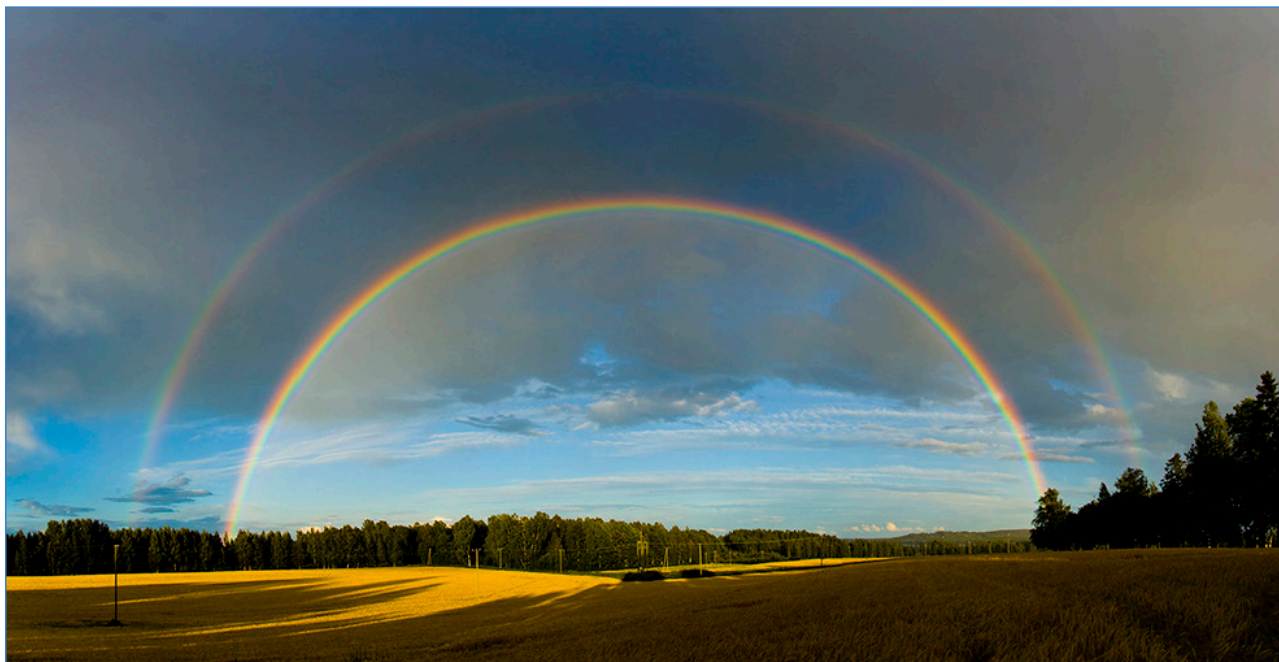
Figure 3: A double rainbow as seen in Finland.

Figure 3 shows a rainbow. Do rainbows produce light or reflect light? Tick a box to show what you think: