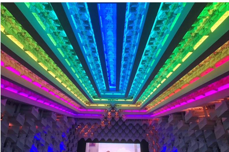
Figure 2: Coloured lights on the ceiling of The Capitol theatre in Melbourne.

In Figure 2, we can see the ceiling of a theatre as it is covered in special bulbs called LEDs that are producing light of different colours.