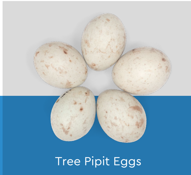
Tree Pipit Eggs