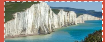
Chalk cliffs at Seven Sisters, Dover, UK

• Limestone is a harder grey rock which can form spectacular caves, some of which are open for the public to explore.