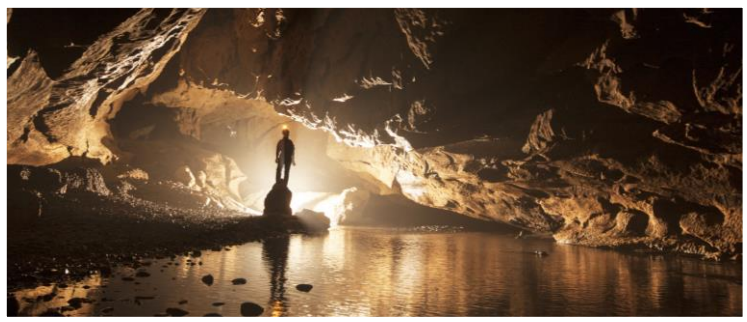
Cracks in the rocks grow as soluble minerals dissolve, and after many years may form caves big enough to walk around in. As the water evaporates, the newly solid minerals form beautiful shapes.

When rainwater falls it soaks into the ground and flows slowly down through the soil and eventually into the rocks beneath us. Some of the minerals in these rocks mix with rainwater in the same way that sugar mixes with tea, by separating into particles too small to see. This process of dissolving in the water forms a solution . Minerals which do this are called ' soluble ' minerals. Other minerals that don't dissolve are ' insoluble '.