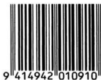
A barcode (UPC) from a box of Weet-Bix™

It is possible to come up with a checksum of the value of 10, which would require more than one digit. When this happens, the character X is used.